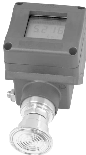
Diaphragm Seal, Tri-Clamp Connection Model 990.22 with Universal Transmitter Model UT-10