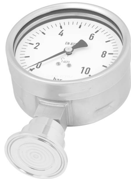
Diaphragm Seal, Clamp Connection Model 990.52 with Pressure Gauge Model 232.50 NS 100

KN 62 Liquid Paraffin (medical white oil), pharma-compatible, FDA approved, according to standard US Pharmacopoeia XXIII and European Pharmacopoeia (1993)